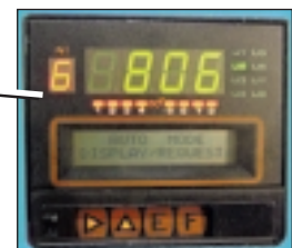
8" Class 300 valve hot cycled at 150 psi steam superheated to 800°F.