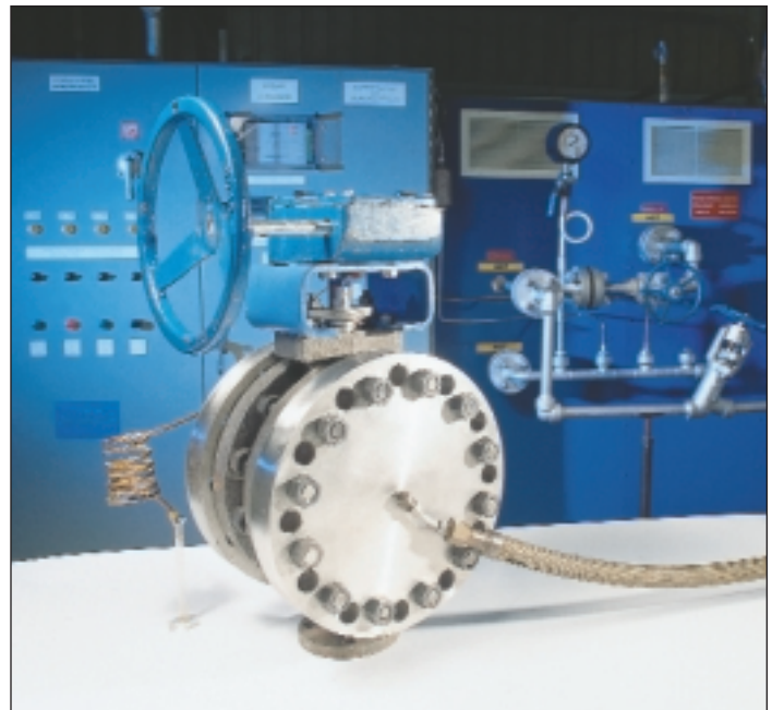
Steam test on 14" Class 150 valve.

The valve under flow of steam at 150–200 psi superheated to 800–900°F passed 7250 cycles without seizing or jamming.